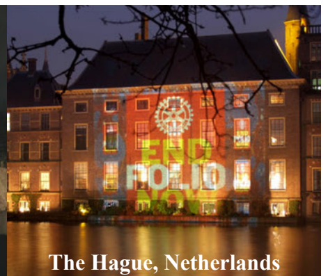
The Hague, Netherlands