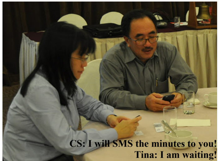
CS: I will SMS the minutes to you! Tina: I am waiting!